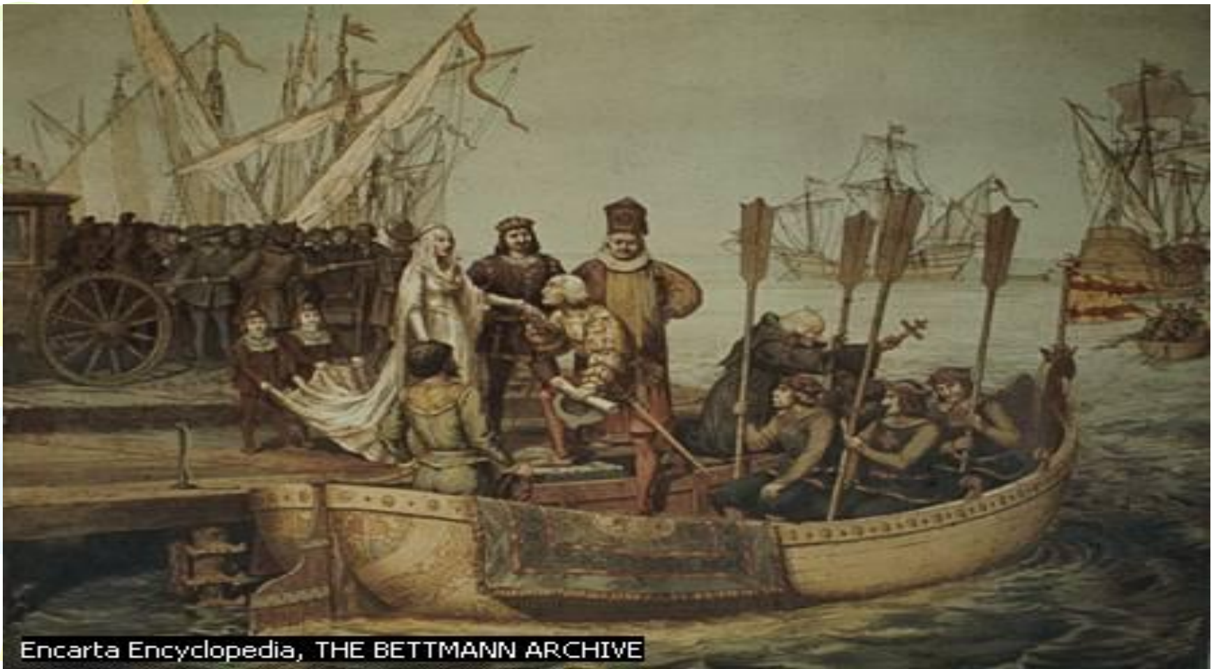
Encarta Encyclopedia, THE BETTMANN ARCHIVE