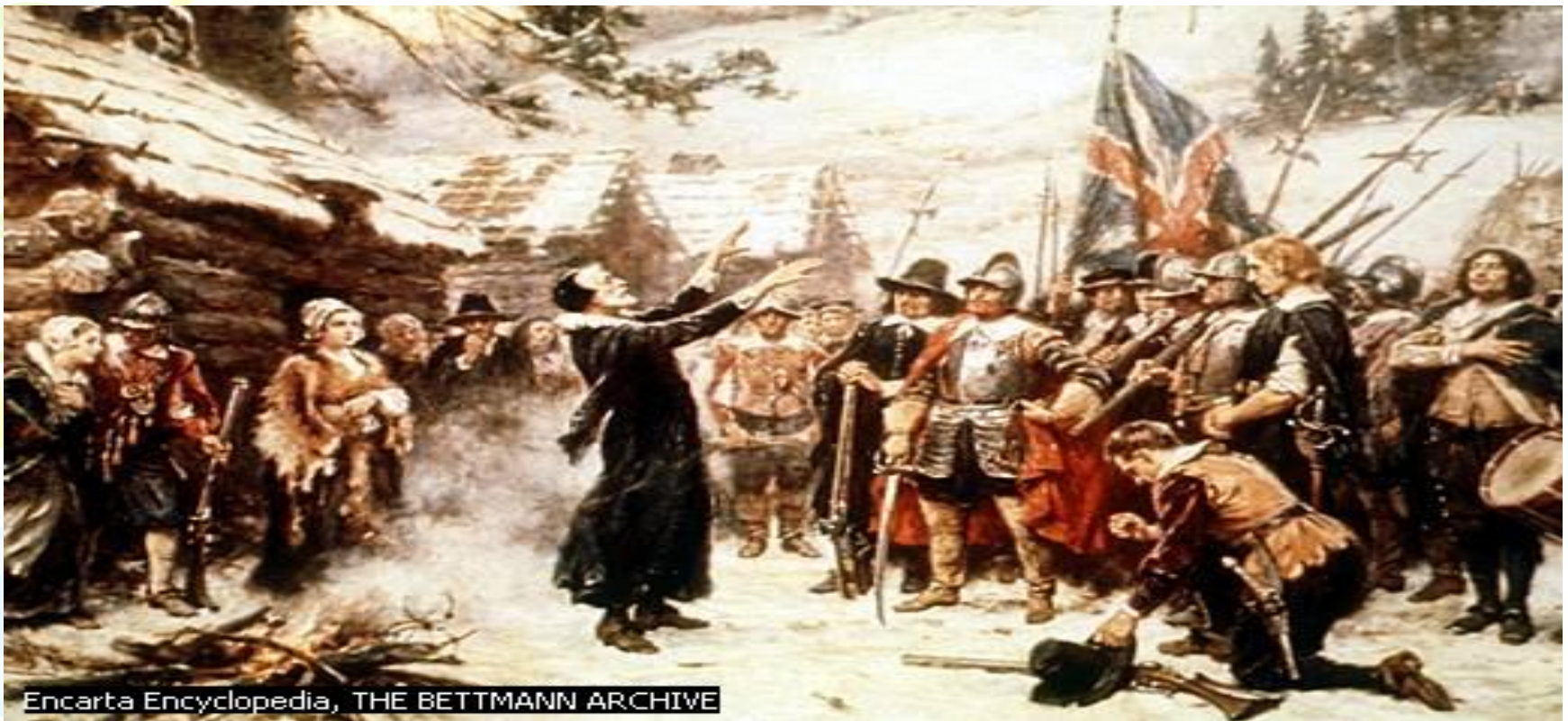
Encarta Encyclopedia, THE BETTMANN ARCHIVE