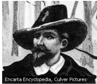
Encarta Encyclopedia, Culver Pictures