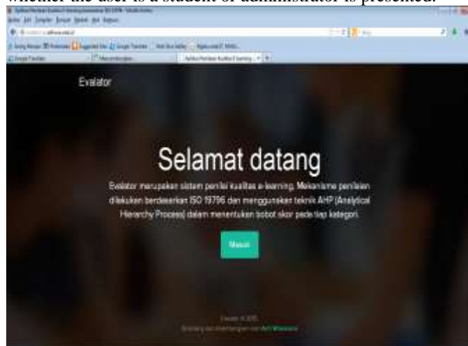
Figure 2. Index Home of Evaluator System

The deficiencies were identified in the assessment, these have been indicated by a number and an explanation in the registration is given below of how the system fails to meet all the criteria in this case. A Web application module applicable to Universitas Negeri Yogyakarta e-learning system, in which each student can evaluate separately each of the e-learning courses in which you are enrolled developed. Access to the application is via a user ID and password assigned to each student from enrollment. In addition the system administrator has the option of consulting results. Access to the system is given from a evaluator web based application main content. By accessing the system the welcome screen where the user must authenticate by entering your username and password in fig. 2. According to the identifier the system recognizes whether the user is a student or administrator is presented.