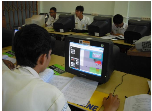
Figure 4. Vocational High School students learn CNC with virtual CNC machine

advantages: saves costs, save time training, safety, and can be accessed anytime.