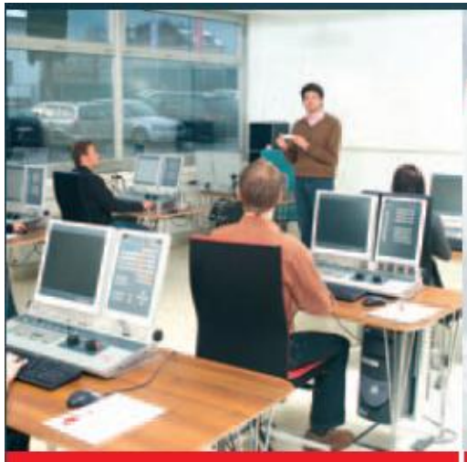
Figure 2. EMCO CNC Training

or slid. The software includes interactive 3-D-objects and users can move, enlarge and shrink graphics using the mouse and the animations can be manipulated.