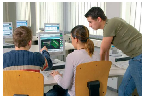
Figure 1. SinuTrain Training

With the option "Virtual machine designed for training purposes", SinuTrain offers – through a 3D simulation of the machining process – reality-identical system operation increasing the efficiency of CNC training (Figure 1). This option allows to "manufacture" workpieces on the PC using reality-identical processes, on the basis of three implemented machine types – including one milling machine and two turning machines, one of these equipped with a counterspindle. The advantage of it is the customer need not buy expensive machines. When the machine purchase costs are too high on account of reduced budgets, the "Virtual machine designed for training purposes" is a low-cost alternative to CNC training.