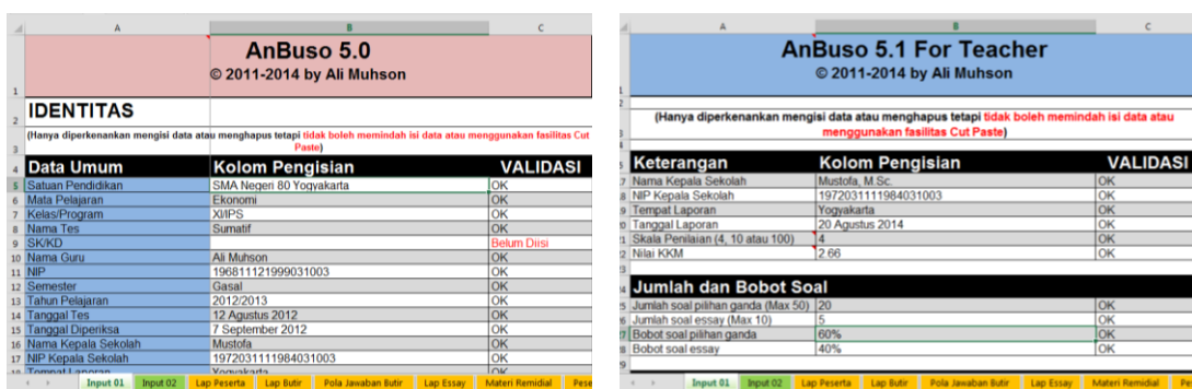
Previous visual display New visual display Figure 1. The spreadsheet of Input01 before and after modifications

The software has undertaken some important modifications in order to be compatible with the assessments system of the 2013 curriculum. Some revisions were conducted to improve its visual display, Input01 spreadsheet, Participant Reports spreadsheet, Participant Remedial spreadsheet, and formula changes. The modifications on the visual displays had to be done because it had too many color variations, which have made the application less attractive. The adjustments were done not only on the input spreadsheet, but also on the report spreadsheet (see Figure 1). They were made based on the respondents' feedback.